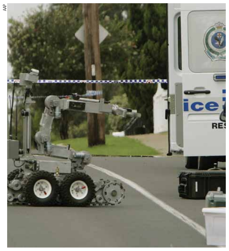
HOMEGROWN HORROR: Australians implicated in potential attacks

www.aph.gov.au/jcpaa jcpaa@aph.gov.au (02) 6277 4615