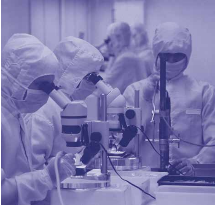
DISEASE CONTROL: Collaboration needed with regional neighbours

Cross border collaboration vital for disease control.