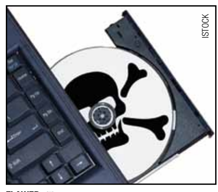
FLAWED: Treaty may impact consumers

"We want to allow that law reform commission report to proceed and we think that there is a risk if we ratify ACTA now that we will effectively lock