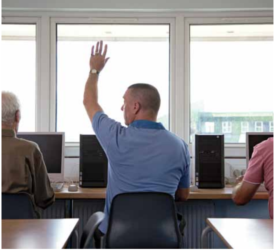
HELP DESK: Libraries can provide cyber training for seniors

ibraries are in a prime position to help seniors have a safe online experience, but the Australian Library and Information Association (ALIA) has told federal parliament's Cyber-Safety Committee they are constrained by the limited resources currently available to them.