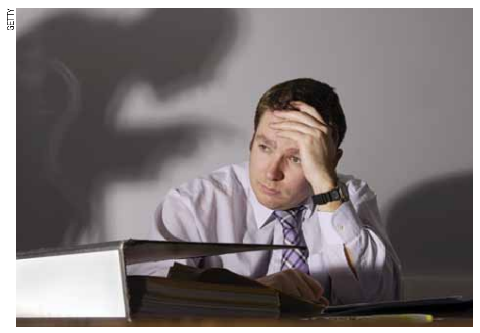
HARASSED: Millions of workers face bullying during their careers

www.aph.gov.au/ic ic.reps@aph.gov.au (02) 6277 2352