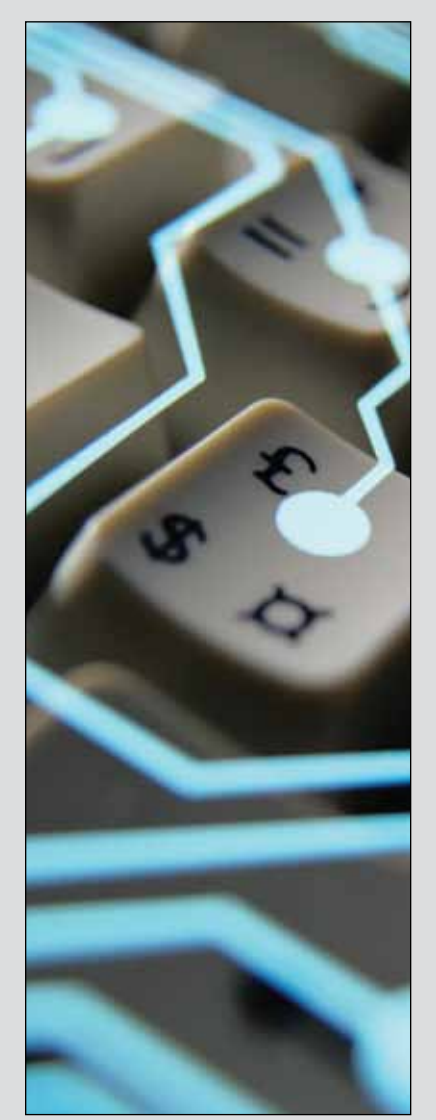
PRICE WATCH: IT costs under scrutiny

LINKS www.aph.gov.au/jsct jsct@aph.gov.au (02) 6277 4002